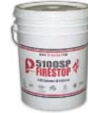
5100SP– Endothermic Spray

PACKAGING 5 us gal. (18.9 L) pail (tapered)