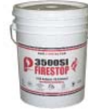
3500SI – Intumescent Spray