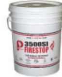
3500SI – Intumescent Spray

PACKAGING 5 us gal. (18.9 L) pail (tapered)